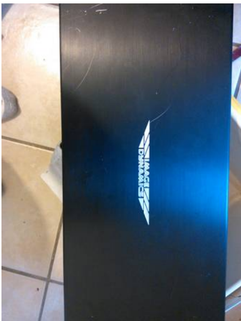
IMAGE DYNAMICS Q1200 IN EXCELLENT CONDITION 14 POUND AMP 1ohm STABLE TRUE POWER HOUSE CAN TEST BEFORE PURCHASING FOR ANY ADDITIONAL INFORMATION FEEL FREE TO CONTACT

Location Louisiana https://www.genclassifieds.com/x-315293-z