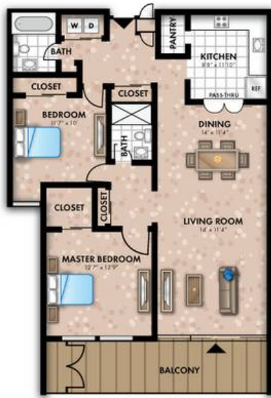
WEST LAKE 2B - TWO BEDROOM / TWO BATH - 1255 sq. ft. Square footage is approximate

Location Iowa https://www.genclassifieds.com/x-371732-z