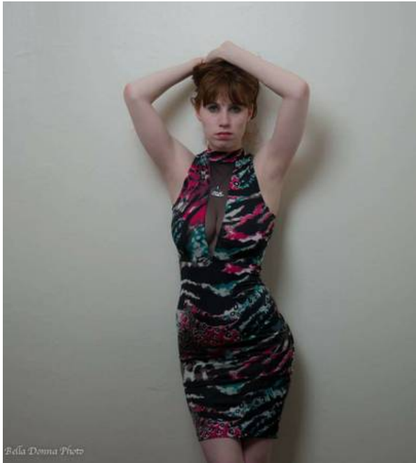
Edla Dama Photo

Location New Hampshire https://www.genclassifieds.com/x-372599-z