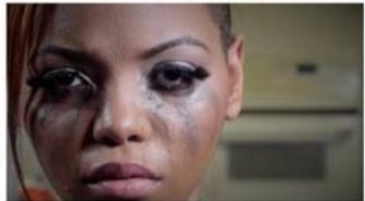
Young P 973 Feat. Lanae Bond - Fall So Hard [Untouchable Music Group Submitted] Views: 1963199

MUST HAVE RELIABLE TRANSPORTATION. MUST BE AT LEAST 18 YRS OR OLDER WITH ID. MUST BE AVAILABLE JUNE