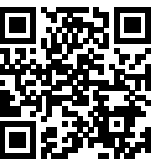
FIGURE MODELING FOR AN ARTIST (United States) https://www.genclassifieds.com/x-626870-z